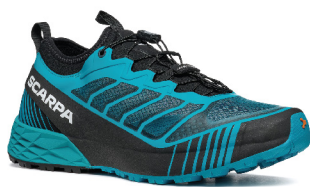
MEN'S | AZURE / BLACK