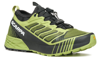
WOMEN'S | LIGHT GREEN / GREEN