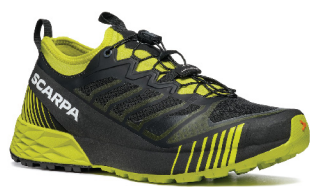
MEN'S | BLACK / LIME