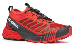
WOMEN'S | BRIGHT RED / BLACK