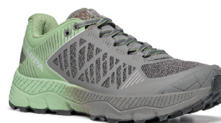
WOMEN'S | SHARK / MINERAL GREEN