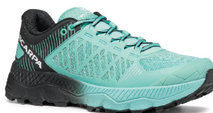
WOMEN'S | ARUBA BLUE / BLACK