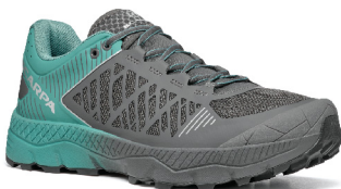
MEN'S | IRON / DEEP SEA