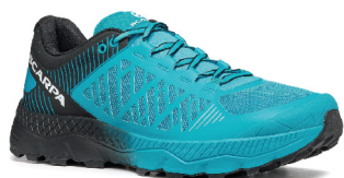
MEN'S | AZURE / BLACK

Click to learn more about the Spin Ultra or watch online at bit.ly/SpinUltra